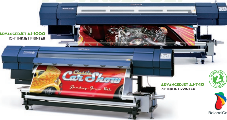
ADVANCEDJET AJ-740 74" INKJET PRINTER