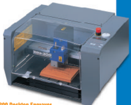
Model EGX-300 Desktop Engraver

Max. operation area: 12" x 8-1/16" (305 mm x 205 mm)