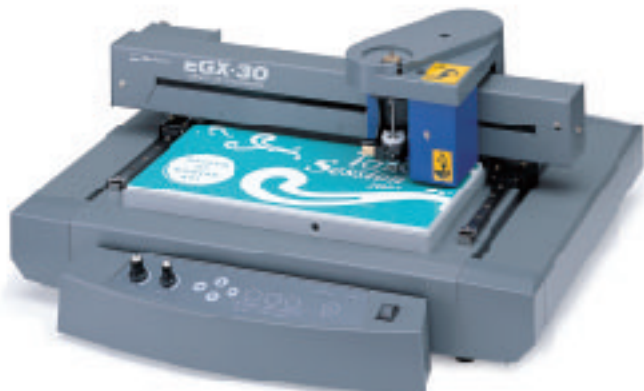
Model EGX-30 Desktop Engraver

Max. operation area: 12" x 8-1/16" (305 mm x 205 mm)