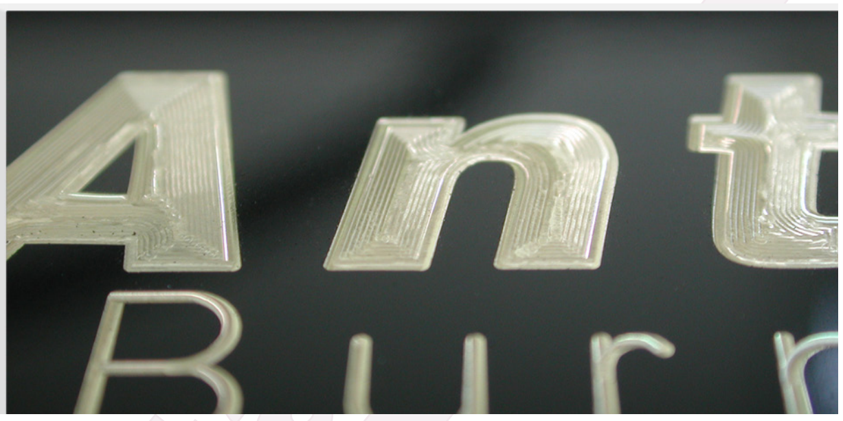
Example of burnishing. Shows single line font and fill font.

One way to simplify the burnishing process and achieve consistent results is through the use of a spring loaded burnishing attachment. These devices are used in place of the conventional knob and have an internal spring that applies the correct amount of pressure. These attachments usually require a burnisher that is longer than normal, so be sure to specify that you are using one of these attachments when ordering to ensure you get the proper length tool.