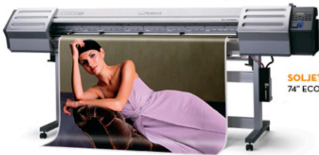
SOLJET PRO II V SJ-745EX 74" ECO-SOLVENT INKJET PRINTER