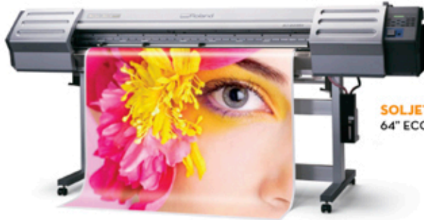
SOLJET PRO II V SJ-645EX 64" ECO-SOLVENT INKJET PRINTER