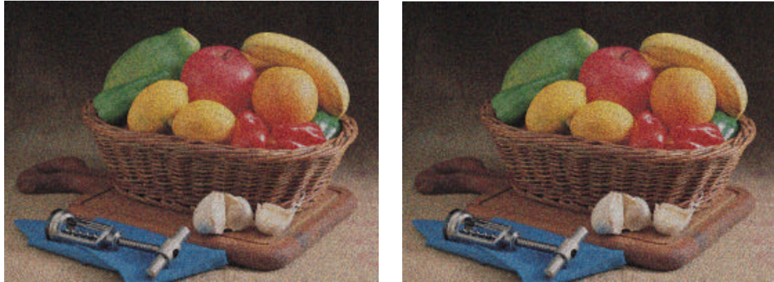
Sample Prints of 360 dpi vs. 720 dpi ( Scanned )

While the numbers of colors used to compose an image are important to image quality, nothing is more important than dots per inch ( dpi ). The SOLJET's microdot achieves continuous tone color. The key to maintaining such high resolution is to control the ink dot with micron precision motor technology as the Roland media feeding system does. The mechanical structure, motor quality and calibration of the SOLJET all contribute to ensure hi-resolution print quality with 1.76 micron in media feed control.