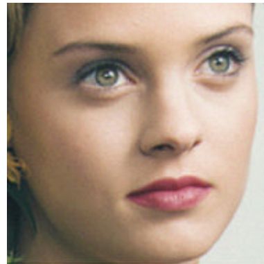
Sample Prints of 4-color vs. 6-color (Scanned)