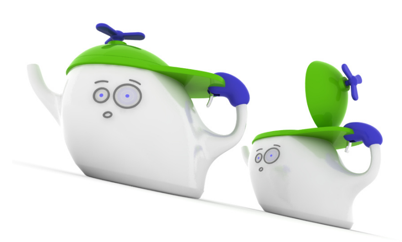
© 2009 by T-Splines, Inc. and SchultzeWORKS DesignStudio