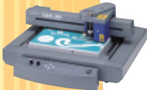
EGX-30 $2,995 us