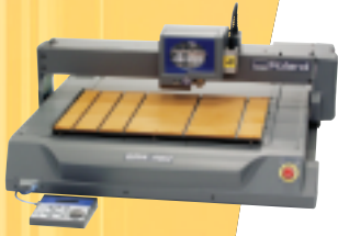
EGX PRO 400 $9,995 us EGX PRO 600 $11,995 us