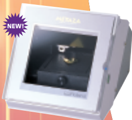
MPX-60 $2,495 us

More choices lead to greater opportunities which is the hallmark of the Roland Engraver Series. From the simple scribing or engraving of nameplates and awards to the most detailed 3D reliefs, Roland's innovative engraving machines combine remarkable precision, versatility and ease of use with unsurpassed value. They're perfect for a wide range of engraving jobs from awards to ADA signage to personalized jewelry. Every Roland engraver is backed by the best support in the industry and comes bundled with a complete suite of software.