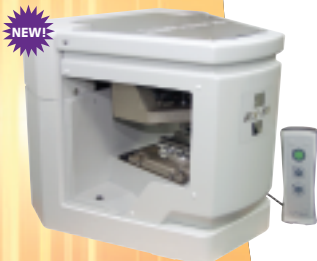
RX-50 $9,995 us