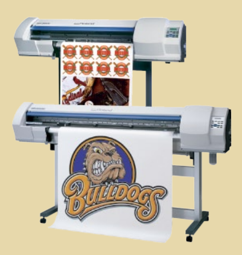
VERSACAMM ° SP-300V $14,995 US SP-540V $19,995 US