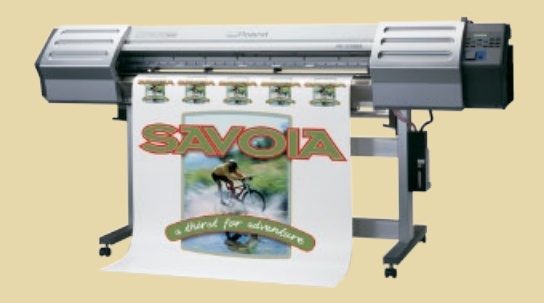
SOLJET™ PRO II V SC-545EX $29,995 US