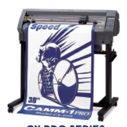
CX PRO SERIES CX-300 $3,295 US · CX-400 $4,295 US CX-500 $5,295 US