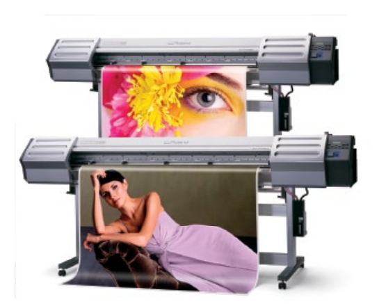
SOLJET™ PRO II V SJ-645EX $29,995 US SJ-745EX $32,995 US

We wrote the book on print/cut technology, literally. It's an informative guide full of step-by-step techniques for putting it to work for your business. To get your free copy, call 800-542-2307, or visit www.rolanddga.com/mystery.