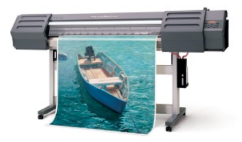
HI-FI JET™ PRO II FJ-540 $21,995 US